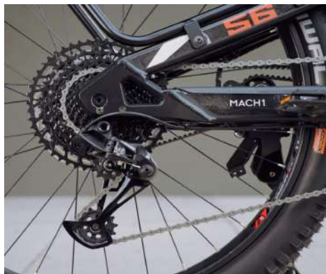
Chain on the pedaling side

Proven and patented technology since 2017.