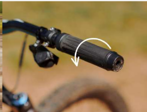
Throttle on the handlebars