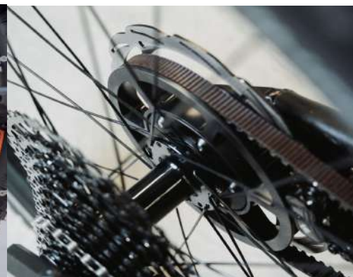
Belt on the motor side